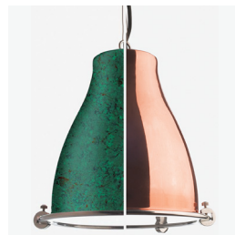
POLISHED COPPER UNLACQUERED*