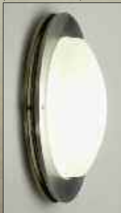
d8040-1FF24-120-AL (As ADA wall sconce)