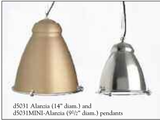
d5031 Alanzia (14" diam.) and d5031MINI-Alanzia (9 1/2" diam.) pendants