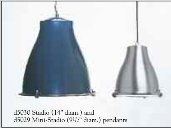
d5030 Stadio (14" diam.) and d5029 Mini-Stadio (9 1/2" diam.) pendants